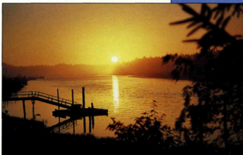
KODACHROME 200 Film